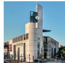
Main Entrance / Ticket Counter