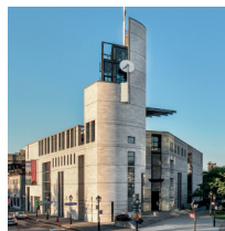
Main Entrance / Ticket Counter