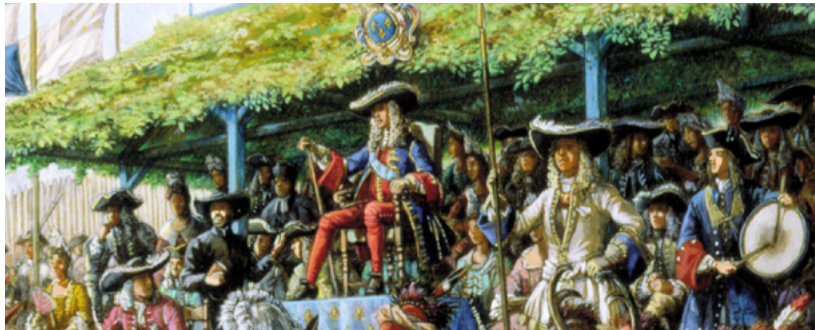
Louis-Hector de Callière (1648 - 1703)