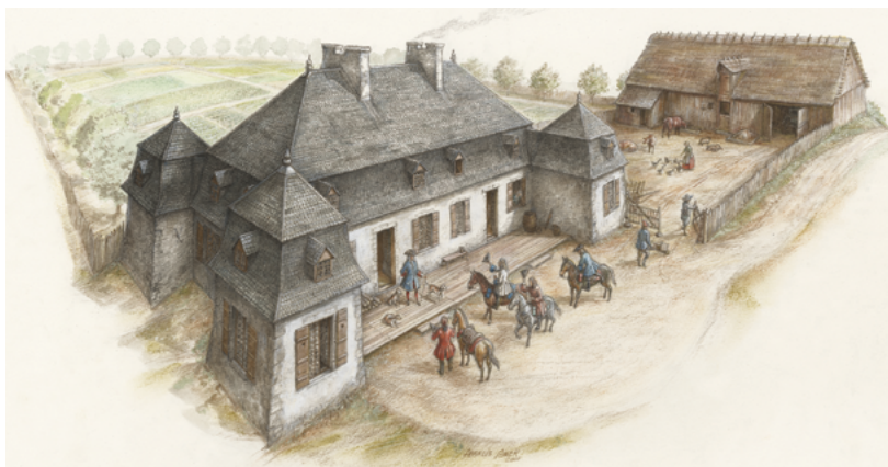
Here is an artist's impression of my residence, which I had built in 1695.